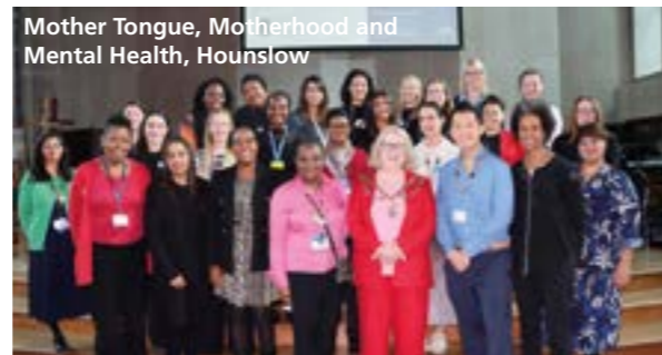
Mother Tongue, Motherhood and Mental Health, Hounslow

If you would like the Mayor to attend your event please email: mayor@hounslow.gov.uk