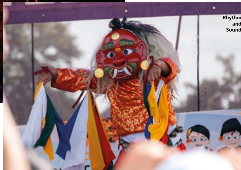
Rhythm and Sound

South Asian Heritage Month played host to the new Rhythm and Sound programme in August. The event included a 'mini mela' that involved hosting games, activities, stalls, food providers, a funfair and a full stage line up of local talent representing different South Asian countries. The day was also full of fantastic food and performances.