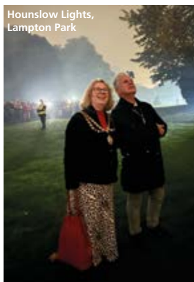
Hounslow Lights, Lampton Park

If you would like the Mayor to attend your event please email: mayor@hounslow.gov.uk