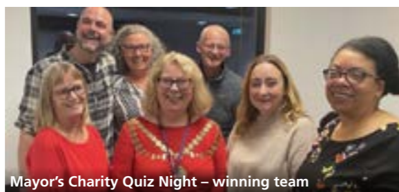
Mayor's Charity Quiz Night – winning team