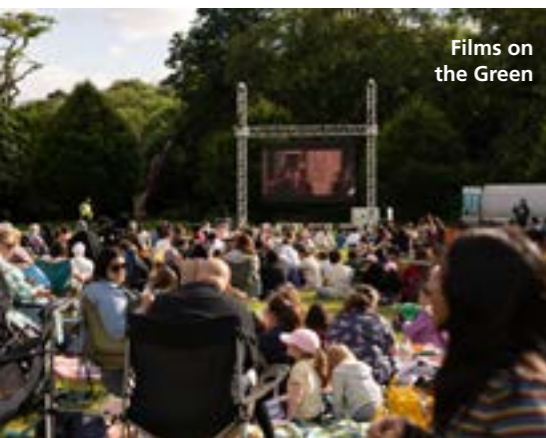
Films on the Green

Three outdoor film screenings were held in parks and open spaces, but the third had a twist – both the film and the park were voted for by the public. The most popular showing was Wonka with almost a thousand residents in attendance. Each film screening attracted visitors from across the borough who came ready with picnics and popcorn to watch a film with their friends and neighbours.