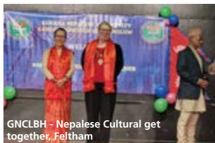
GNCLBH - Nepalese Cultural get together, Feltham