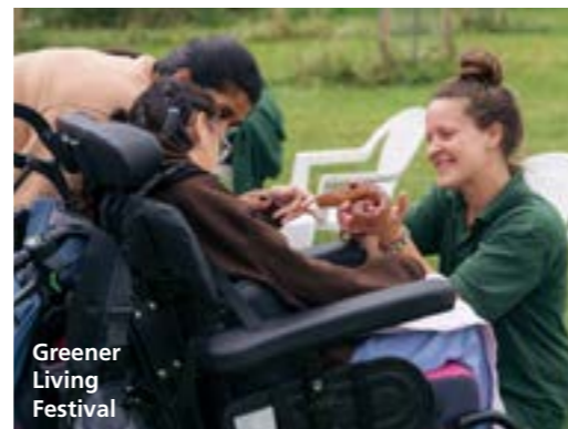
Greener Living Festival

Taking place at Lampton Park, the latest event had more activities for residents to get involved in and initiatives to learn about. Stallholders, including local community and clear-up groups, helped raise awareness of the small changes needed to make a huge impact on carbon footprints. Residents were encouraged to help make a bug hotel with Greenspace 360's Countryside Team which will remain onsite to encourage biodiversity.