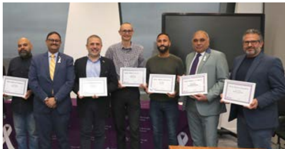
Hounslow Council recently marked White Ribbon Day, the International Day for the Elimination of Violence against Women, 25 November, by fixing White Ribbon signs to lampposts along Hounslow High Street.

As one of only seven White Ribbon accredited London councils, Hounslow stands with organisations and individuals all over the world, in encouraging men to show their commitment to ending violence against women and girls, in line with this year's White Ribbon Day theme: It Starts With Men.