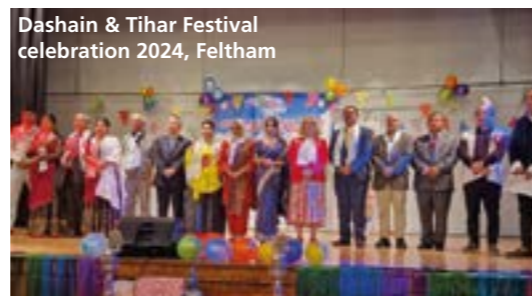
Dashain & Tihar Festival celebration 2024, Feltham