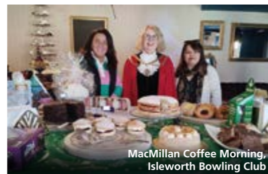
MacMillan Coffee Morning, Isleworth Bowling Club