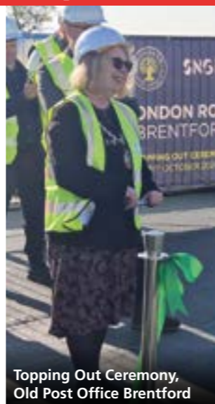
Topping Out Ceremony, Old Post Office Brentford