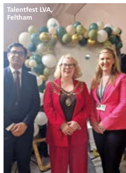
Talentfest LVA, Feltham