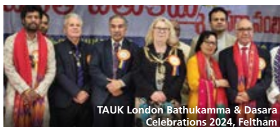
TAUK London Bathukamma & Dasara Celebrations 2024, Feltham