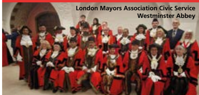
London Mayors Association Civic Service Westminster Abbey