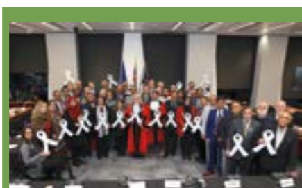
Cross-party Councillors and the Mayor of Hounslow, stood together at Borough Council on 26 November, to acknowledge the White Ribbon campaign and support 16 Days of Activism against Gender-Based Violence.

This campaign aligns with the Council's Corporate Plan, Violence Against Women and Girls Plan, Safer Communities Strategy and as well as its longstanding commitment to tackling violence against women and girls.