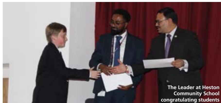
The Leader at Heston Community School congratulating students

He handed out awards for outstanding end of year results, from mathematics to the arts students who have shown impressive progress.