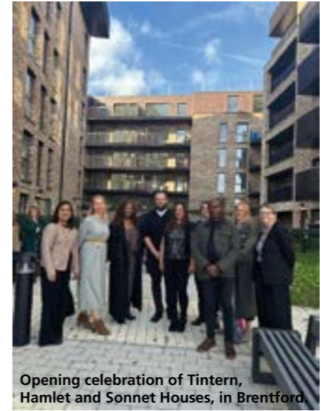
Opening celebration of Tintern, Hamlet and Sonnet Houses, in Brentford.

At Burlington Close, 61 new affordable homes have been added across three