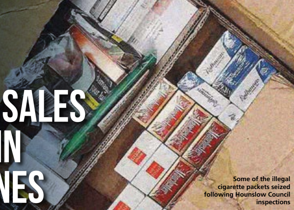
Some of the illegal cigarette packets seized following Hounslow Council inspections

Thousands of cigarettes and other items have been taken out of circulation following a crackdown from the Council, which has left three borough shop owners coughing up hefty fines.