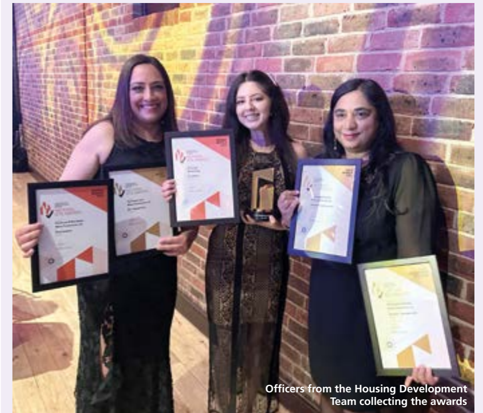
Officers from the Housing Development Team collecting the awards

Hounslow Council's Clements Court housing development has won top accolades in the prestigious Considerate Constructors Scheme (CCS) National Site Awards, securing the Gold Award and being named The Most Considerate Site of 2024.