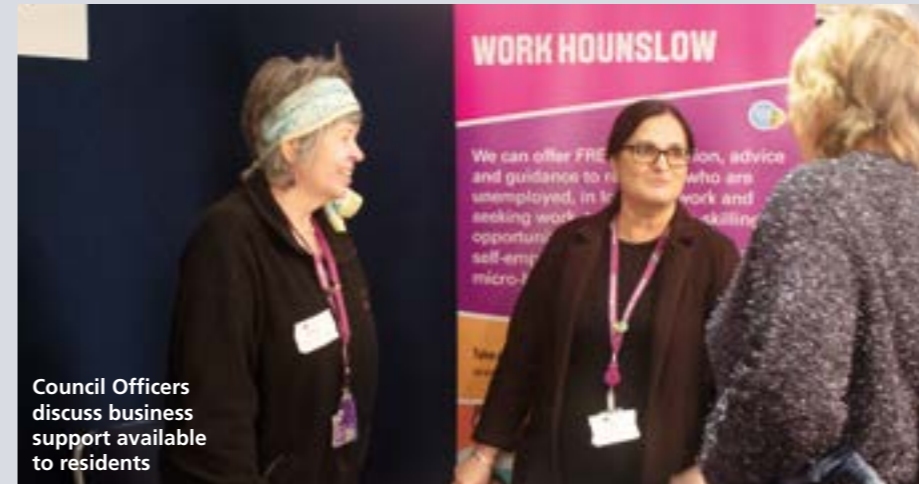
Council Officers discuss business support available to residents

An ongoing initiative launched in October 2023 to offer free business support and advice has been extended until the end of the year.