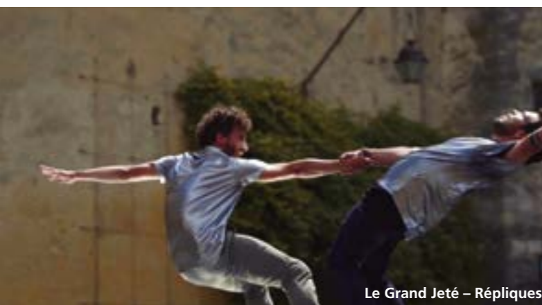
Le Grand Jeté – Répliques

of gravity as they take us on a thrilling dancer-acrobat journey to show how movement and gesture can be performed when you are either a dancer-acrobat or an acrobat-dancer.