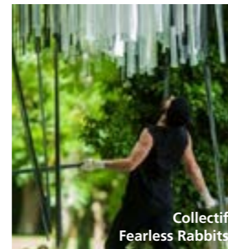
Collectif Fearless Rabbits

A physical theatre show, where combat, resistance and resilience are driving the transformation of space in search of peace.