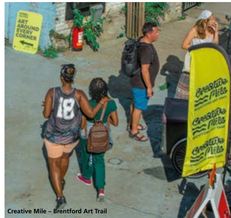
Creative Mile – Brentford Art Trail

Brentford's Art Trail connects venues with exhibiting artists, creatives and makers from Brentford and across the borough for a weekend of open studios and exhibitions.